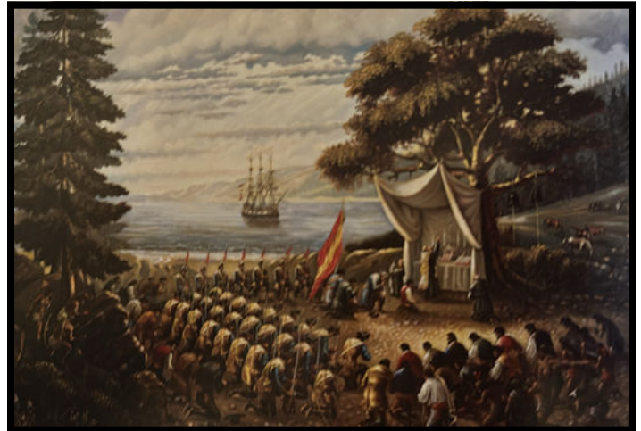
"Leon Trousset's 1877 masterpiece, 'Father Serra Celebrates Mass at Monterey,' immortalizes the founding of Carmel Mission in 1770. This monumental oil painting captures the spiritual dawn of California's colonial era.

Preserving and protecting this oil-on-canvas masterpiece is critical. Measuring 53" x 72", its scale and age make it vulnerable to environmental damage, pigment fading, and canvas deterioration. As one of few surviving works by Trousset—whose commissions included churches across California—it offers irreplaceable insight into 19th-century interpretations of the state's founding myths.