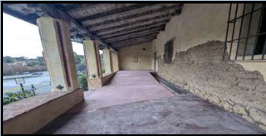
THE RAMP TO THE BLESSED SACRAMENT CHAPEL HAS BEEN INSTALLED

WE ARE EXPECTING THE 1ST PHASE OF THE BSC WORK DETAILED BELOW TO BE COMPLETED IN THE NEXT FEW WEEKS SO WE MAY RESUME DAILY MASSES AND RECONCILIATION.