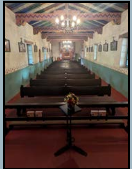
OUR CHAPEL HAS NEWLY RESTORED PEWS