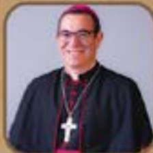
Most Reverend Felipe Pulido San Diego